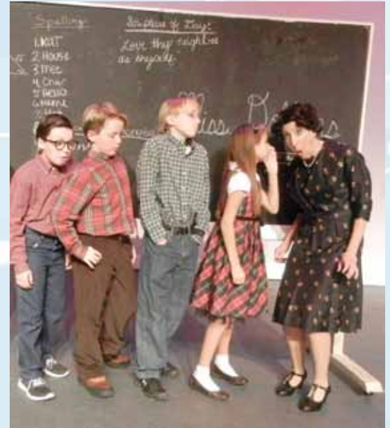
Telling Miss Shields where Flick is.