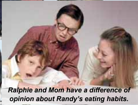
Ralphie and Mom have a difference of opinion about Randy's eating habits.

It's amazing to see what can happen when one person decides that they want to make a difference. We at Stage Right would like to ask you to bring an unwrapped toy to the Crighton Theatre in the next several weeks. Every toy that is given will be passed on to the local Toys for Tots office so that children in our community can have a better Christmas. There will be a box located in