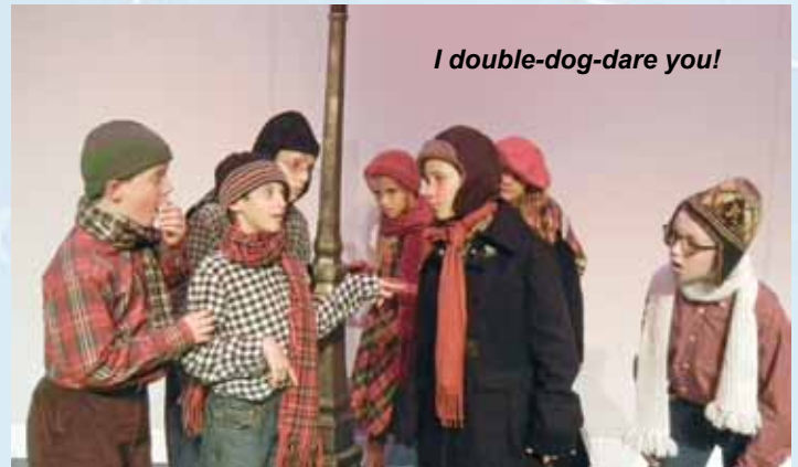
I double-dog-dare you!