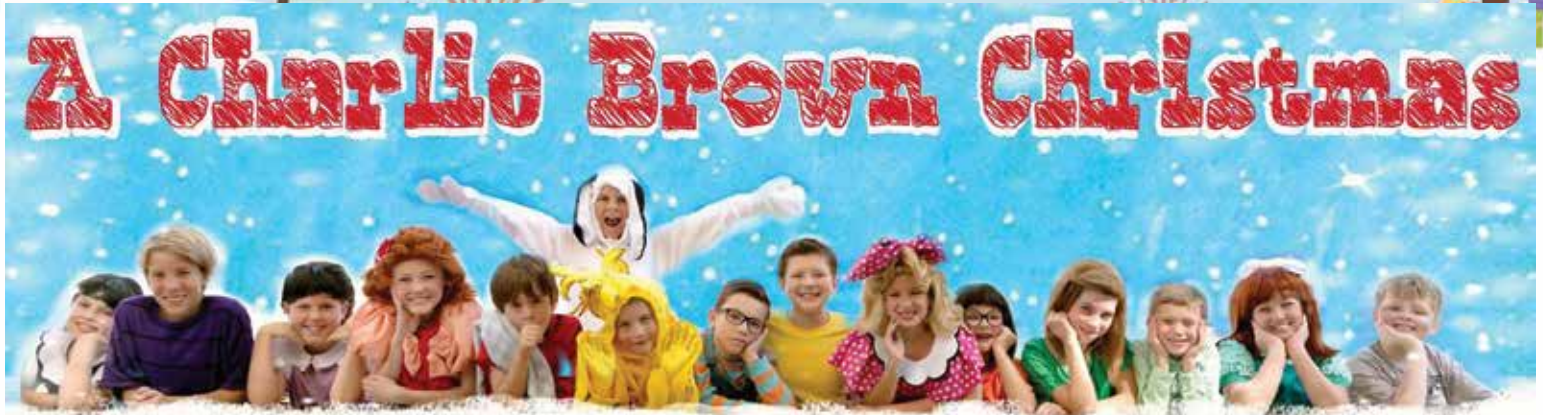
The Peanuts Gang