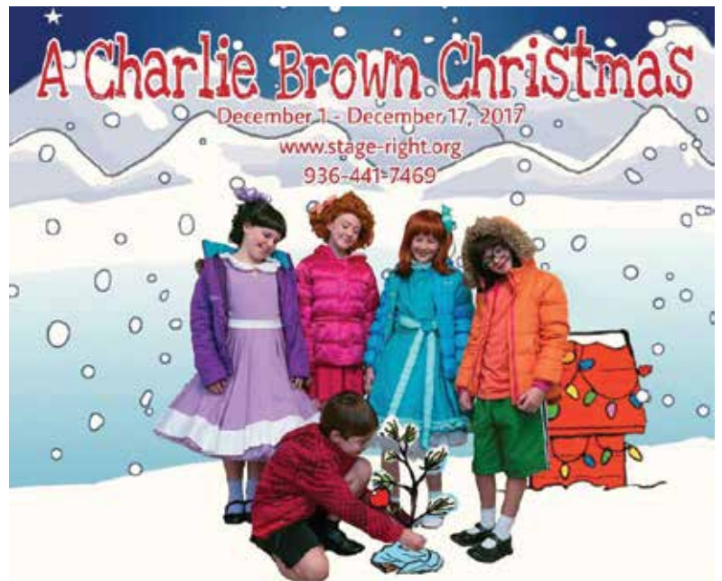
Its not a bad little tree; it just needs a little love