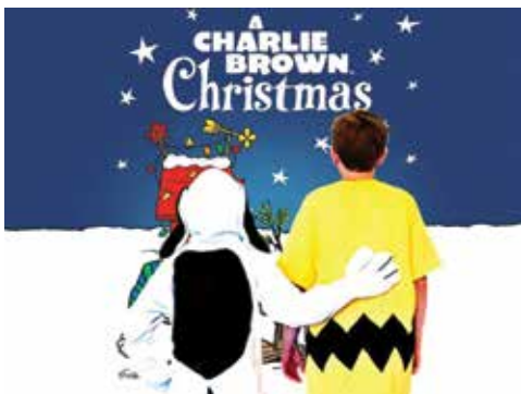
Snoopy and Charlie Brown

"I get to be sassy. I don't want to sound mean