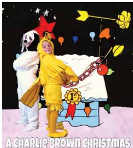
Snoopy and Woodstock