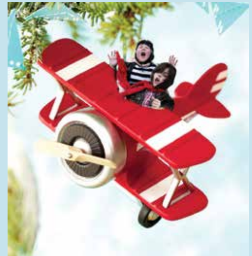
The Red Baron and his henchman