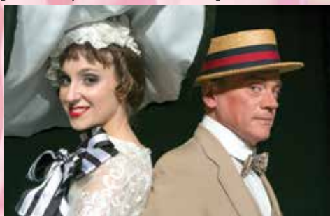
A battle of wills