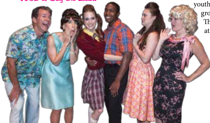
An Unconventional Romance for 1962 to Say the Least!

N. Main St. in downtown Conroe. Our cruise raffle drawing will be held at intermission at the final performance of Hairspray on July 27th. This cruise for two persons is aboard the Royal Caribbean Navigator of the Sea where the winners will set sail Oct.26 for an 8 day 7 night cruise with ports of call including Grand Cayman, Cozumel and Jamaica. Transportation from your home in the Houston area to Galveston is included! Raffle tickets are only $5 for one or $20 for five tickets. Winner does not have to be present to win. Get your raffle tickets at any of the performances of Hairspray or online at www.stage-right.org . ♦