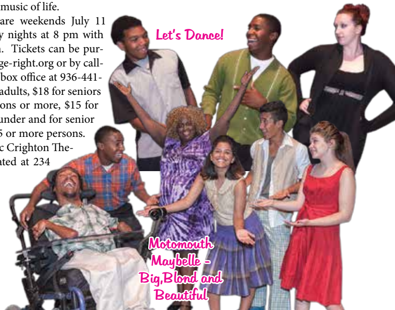
Motormouth Maybelle - Big, Blond and Beautiful