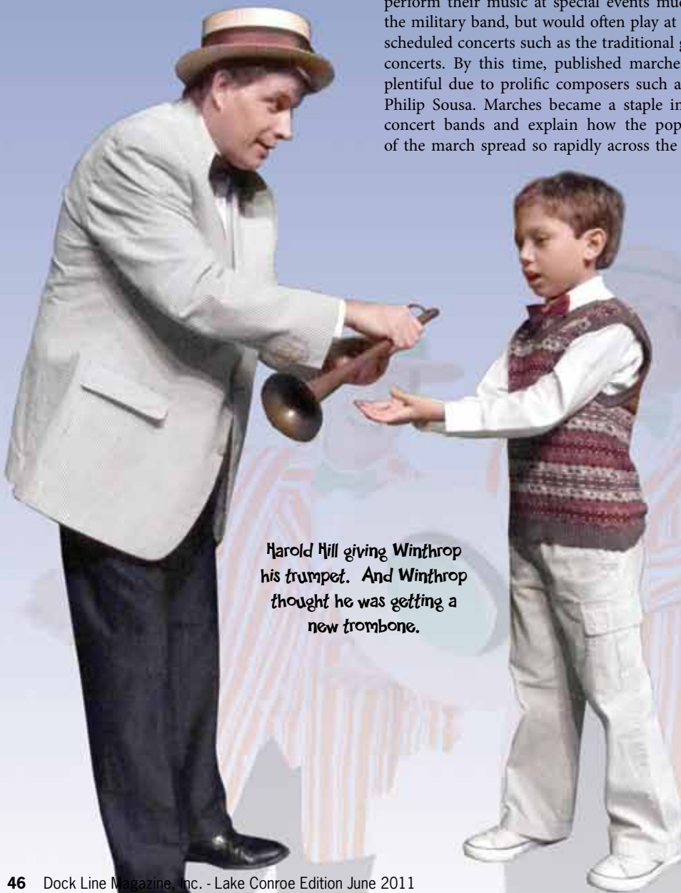
Harold Hill giving Winthrop his trumpet. And Winthrop thought he was getting a new trombone.