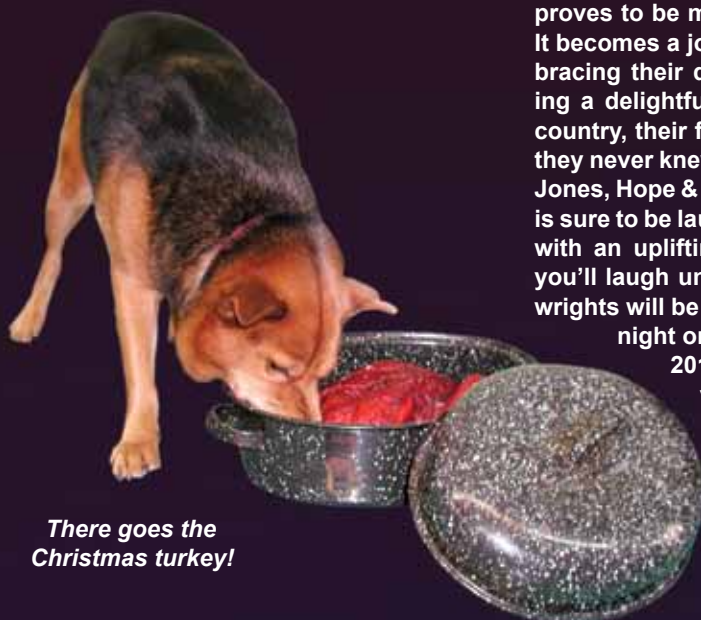
There goes the Christmas turkey!