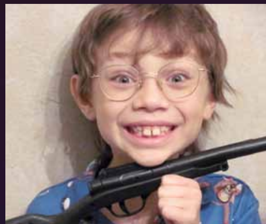
You'll shoot your eye out kid!