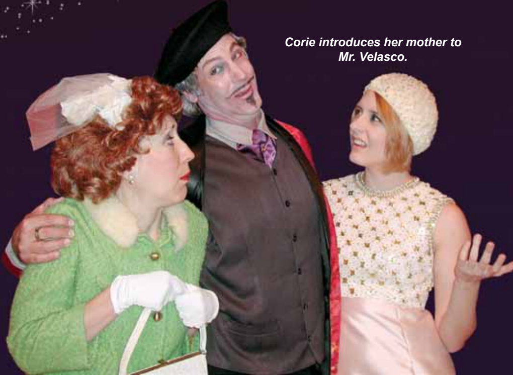
Corie introduces her mother to Mr. Velasco.