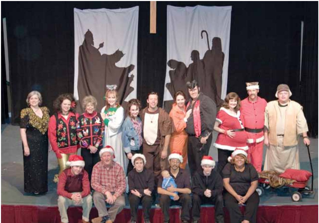
Christmas Belles Cast

The days leading up to December can bring expectations and stresses that can make it easy to forget what we are celebrating. Here are some inexpensive ways to bring back meaning to the holiday season: