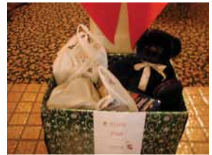
Toys for Tots Donation Box