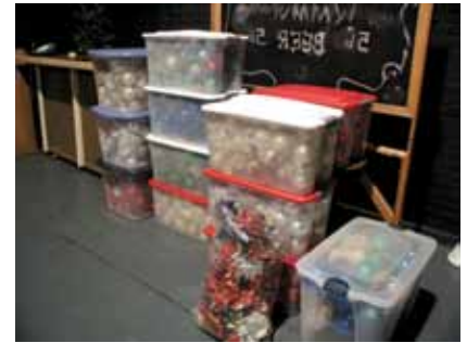
Boxes of Donated Christmas Decorations

ing items to benefit and support our active duty troops through the US Troop Support Foundation, or collecting toys to benefit less fortunate kids. If you come to our Christmas show, have your kids pick out a gift to bring for donation. Have them put it in the donation box. Let them know that some child will have a toy on Christmas morning because they cared.