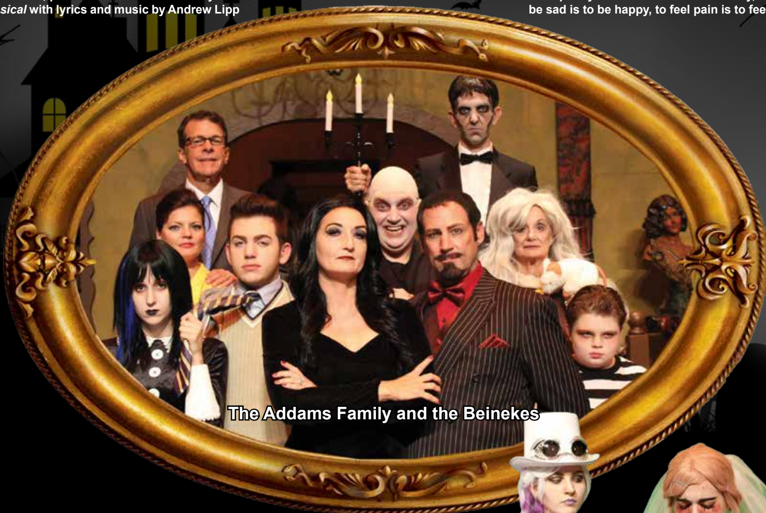
The Addams Family and the Beinekes

who was known for his ghoulishly humorous and macabre characters. In this kooky and spooky world of the Addams Family, to be sad is to be happy, to feel pain is to feel