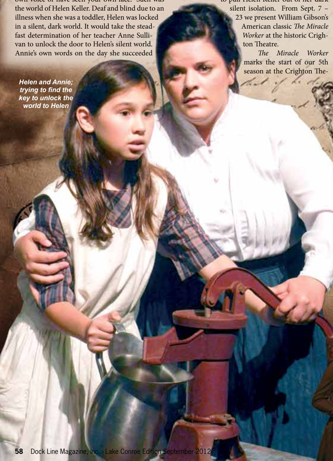
Helen Keller and her teacher Anne Sullivan

Helen and Annie; trying to find the key to unlock the world to Helen